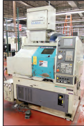
TAKISAWA TC-10 CNC TURNING CENTER