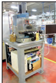
LIGHT MACHINES PROLIGHT MACHINING CENTER