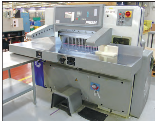
PRISM SQZK-780-NH HIGH SPEED PAPER CUTTER