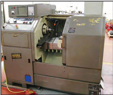
HARDINGE CONQUEST-GT SUPER PRECISION CNC LATHE