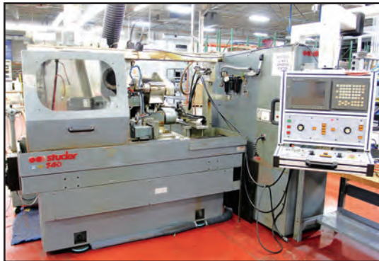
STUDER S40-12 UNIVERSAL CNC CYLINDRICAL GRINDER