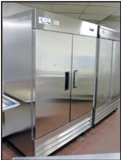
COMMERCIAL REFRIGERATORS AND FREEZERS