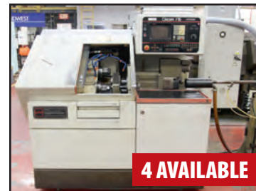
CITIZEN CINCOM F16 AUTOMATIC CNC SWISS-TYPE SCREW MACHINE