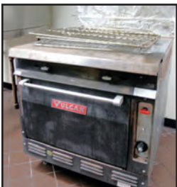
VULCAN 7872 OVEN

ALSO AVAILABLE: PROJECTION SCREENS, CAFETERIA TRAY CARTS, SHELVING UNITS