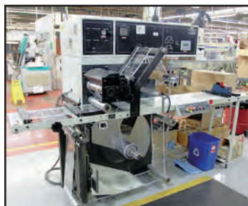
ARPECO PAPER CONVERTING MACHINE