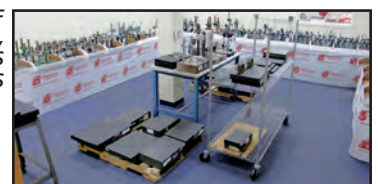
ASSORTMENT OF GRANITE PLATES, INDICATOR STANDS AND LEVER PRESSES