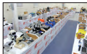
LARGE SELECTION OF MICS, GAGES, MICROSCOPES AND MORE