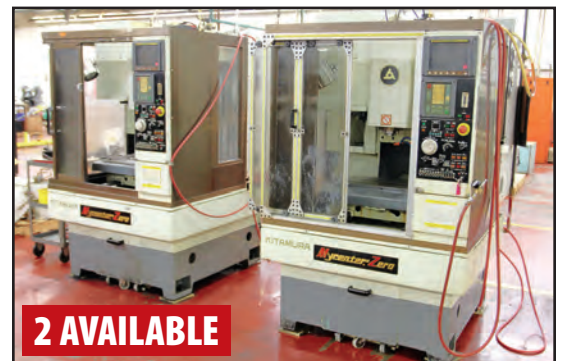
2 AVAILABLE KITAMURA MYCENTER-ZERO CNC VMC