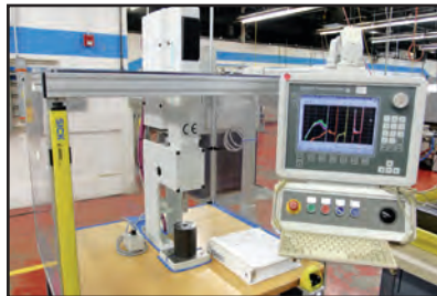
SCHMIDT 405 SERVO ASSEMBLY PRESS