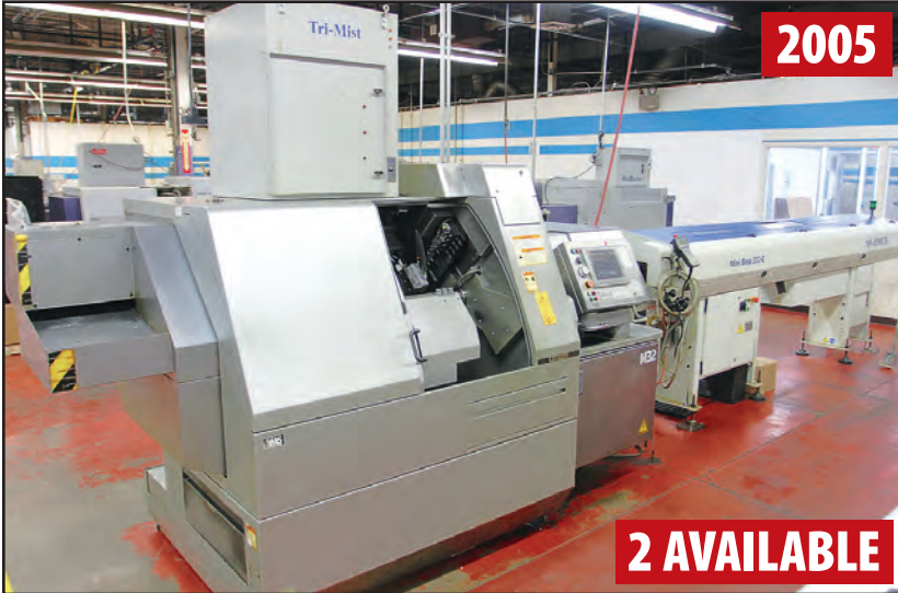
CITIZEN M32 CNC SWISS-TYPE TURNING CENTER

Surplus to the Operations of a CLINICAL DENTAL MANUFACTURER