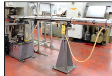
SPEG0 TURNAMIC 64-8.5 BARFEED

(2) 2008 BROTHER TC-22B-0 CNC TAPPING CENTERS, s/n's 111452 and 111501, CNC B00 Control, 27.6" X, 17.7" Y, 16.1" Z, 9.1-25.2" Distance Between Table Top and Spindle Nose End, 31.5" x 17.7" Work Area, 661 Lb Table Capacity, 16-16,000 RPM Spindle Speeds, 8,000 RPM Max. During Tapping, 7/24 Tapered No. 30 Tapered Hole, 2,756 IPM Rapid Traverse Rate X,Y,Z, .04-787 IPM Cutting Feed Rate, BT30 Tool Shank, 27 ATC, Mist Buster, Chip Blaster High Pressure Coolant System, Nikken 5AX130 5th Axis Rotary Table