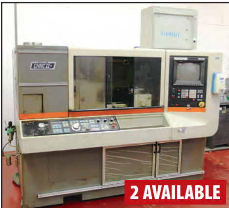
2 AVAILABLE HARDINGE CHNC II+ SUPER PRECISION CNC LATHE