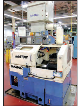
TAKAMATSU MINI-TURN GANG TOOL CNC LATHE