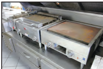
FLAT TOP GRIDDLE, GRILL AND DEEP FRYER