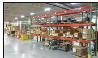
ASSORTED PALLET RACKING