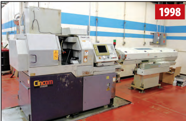
CITIZEN CINCOM L20 CNC SWISS-TYPE TURNING CENTER