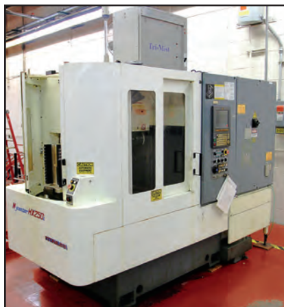
KITAMURA MYCENTER HX250I CNC HMC