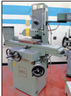
MITSUI HIGH-TEC 250MH SURFACE GRINDER