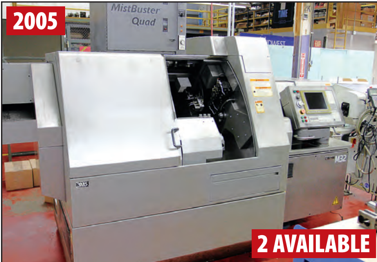
CITIZEN M32 CNC SWISS-TYPE TURNING CENTER

Inspection: Inspection of Assets is STRICTLY BY APPOINTMENT ONLY, on Monday, April 23