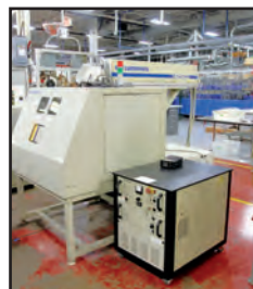
GSI LUMONICS HM1400 LASER MARKER