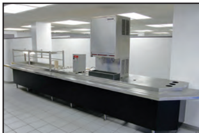
(2) CAFETERIA STAINLESS STEEL SERVING COUNTERS