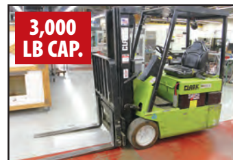
3,000 LB CAP.