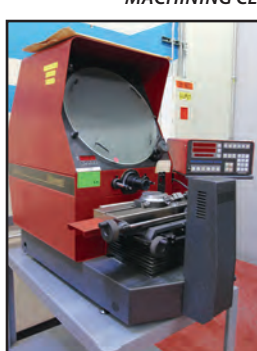
STARRETT HE400 OPTICAL COMPARATOR