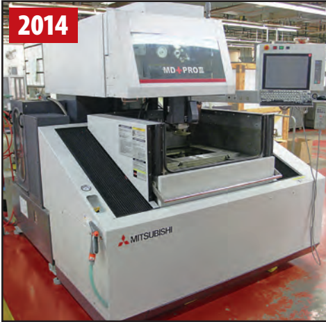
2014 MITSUBISHI MV1200S CNC WIRE EDM