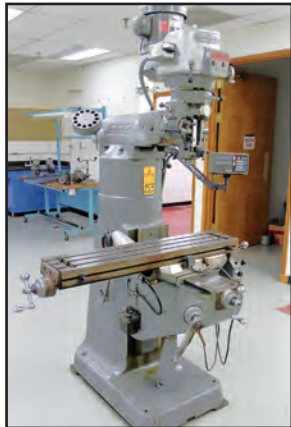
BRIDGEPORT VERTICAL MILLS