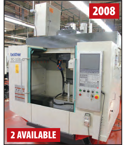
BROTHER TC-22B-0 CNC TAPPING CENTER

Sale Location: 901 W Oakton St., Des Plaines, Illinois 60018