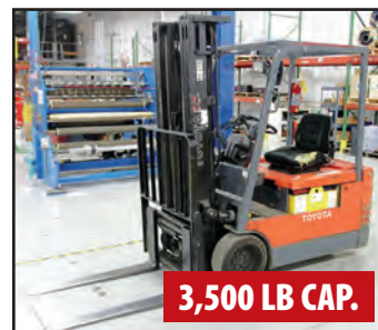
3,500 LB CAP.

ALSO AVAILABLE: DALMEC PRC INDUSTRIAL MANIPULATOR, GORBEL FREE STANDING JIB CRANE SYSTEM, LANTECH PALLET WRAPPING MACHINE, PALLET RACKING, WORK BENCHES, AND MORE