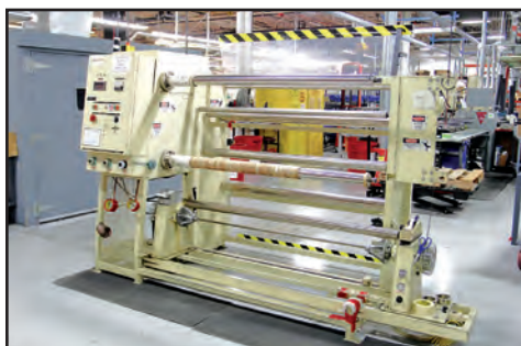
VOORWOOD S64Z SLITTER/REWINDER