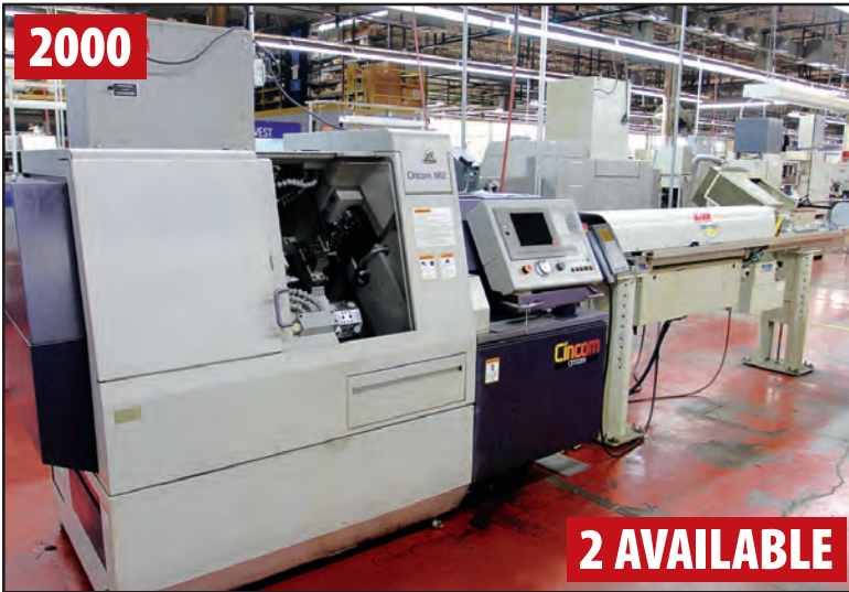
CITIZEN CINCOM M12 CNC SWISS-TYPE TURNING CENTER

(4) CITIZEN CINCOM F16 AUTOMATIC SWISS-TYPE CNC SCREW MACHINES, s/n's 2374, 2417, 2648, and 2165