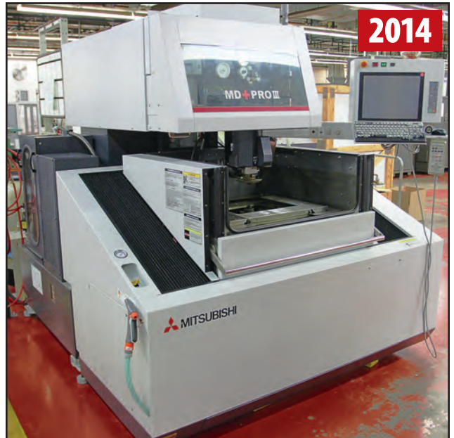
MITSUBISHI MV1200S CNC WIRE EDM