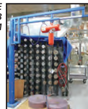
GORBEL FREE STANDING JIB CRANE SYSTEM