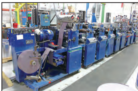
ALLIED GEAR FM3-104 FLEXOMASTER 3 LABEL PRINTING PRESS