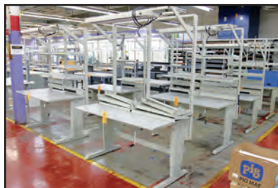
(OVER 100) WORKBENCHES