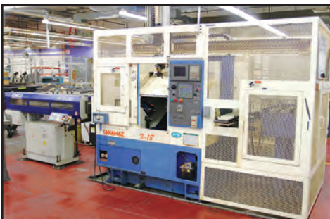
TAKAMAZ X-18 CNC TURNING CENTER