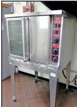
DCS NATURAL GAS CONVECTION OVEN