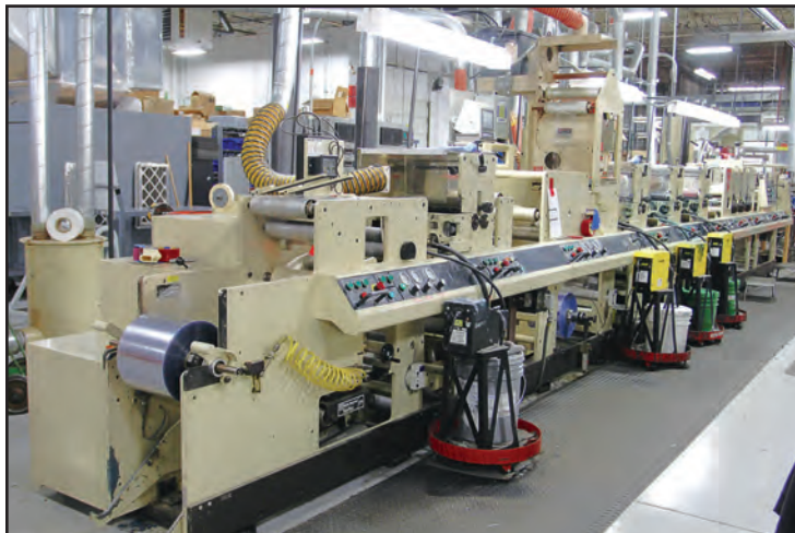
MARK ANDY 4150-10B LABEL PRINTING PRESS

Inspection: Inspection of Assets is STRICTLY BY APPOINTMENT ONLY, on Tuesday, May 22