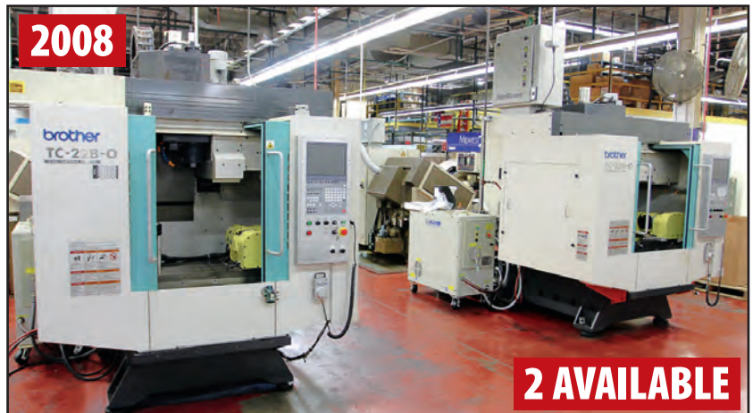
BROTHER TC-22B-0 CNC TAPPING CENTER