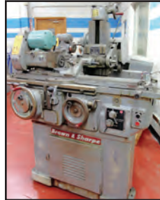
BROWN & SHARPE NO.13 UNIVERSAL TOOL GRINDER