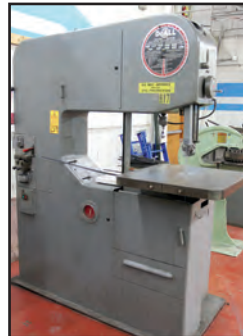
DOALL 3613-0 VERTICAL BANDSAW