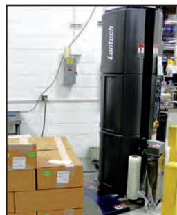
LANTECH PALLET WRAPPER