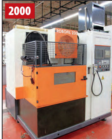
2000 CHARMILLES ROBOFIL 230F CNC WIRE EDM