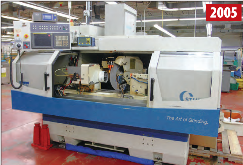
STUDER S33 OD/ID CNC GRINDER

FEATURING: (2) LABEL PRINTING PRESS LINES, PRISM SQZK-780-NH HIGH-SPEED PAPER CUTTER, SLITTERS, SHRINK PACKAGING, (2) PLASTIC BAG PRESS LINES, FORKLIFTS & MORE